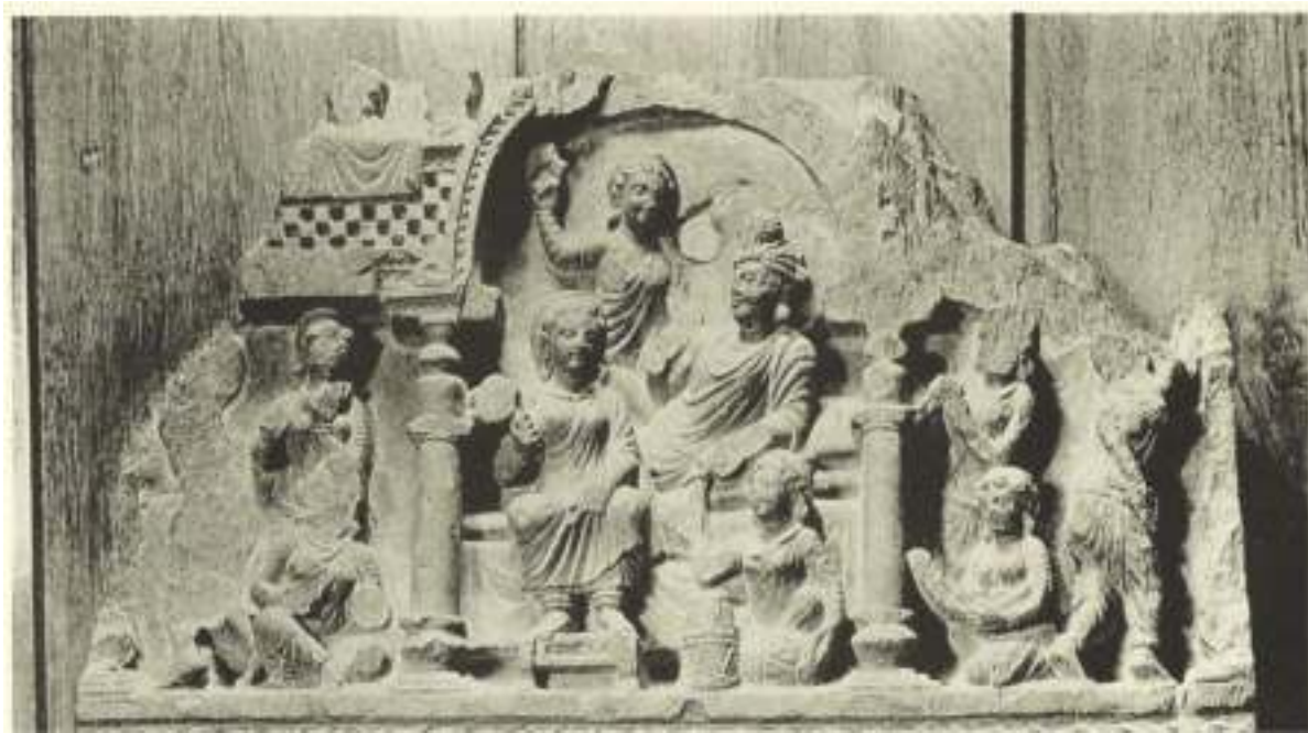
Figure 1: Life in the palace, Karachi, No.507; formerly in Lahore, No. 567. Jamrud