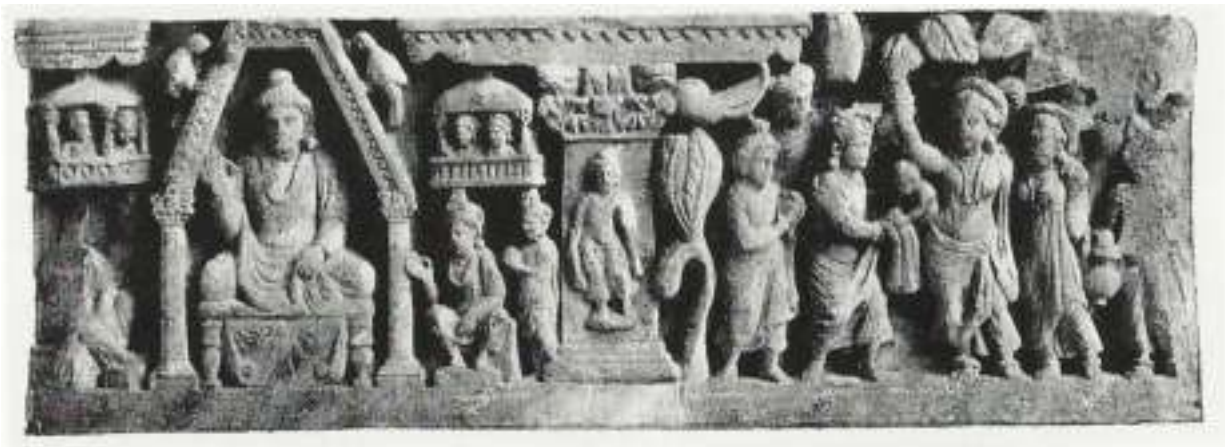
Figure 6: Seated Bodhisattva. From Swat. (Kurita:No. 45).