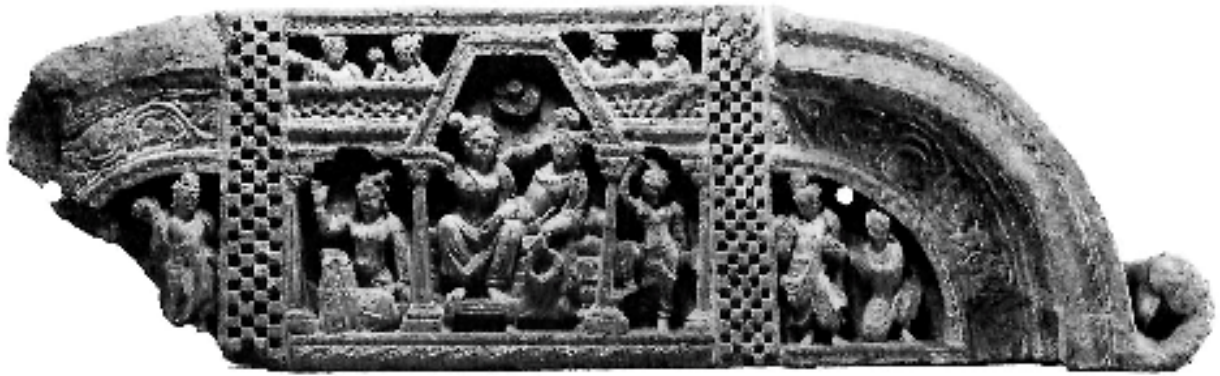
Figure 3: Life in the palace. (Zwalf No. 170).