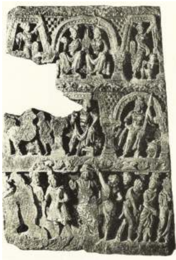
Figure 2: Life in the palace, Lahore, No. 46.