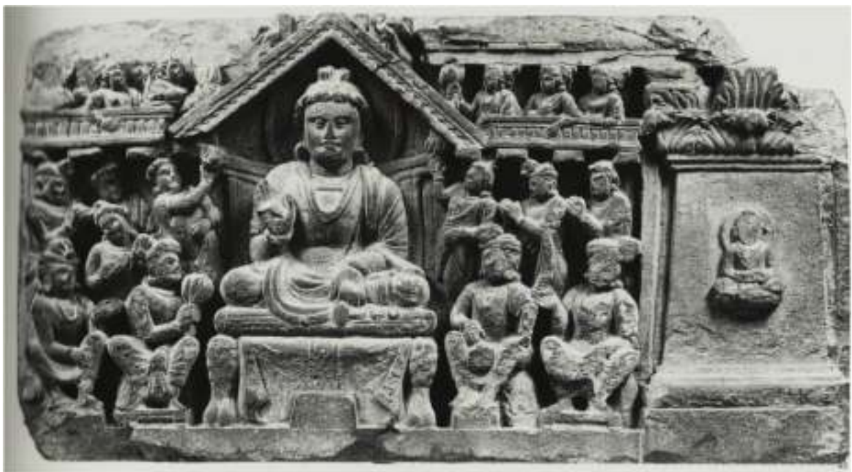
Figure 4: Seated Bodhisattva. (Kurita 1990: No. 43).