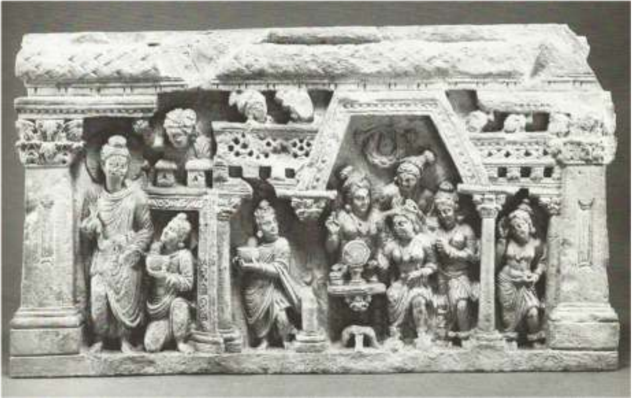
Figure 7: Conversion of Nanda. (Marshall 1973: No. 121; Zwalf : No. 205)