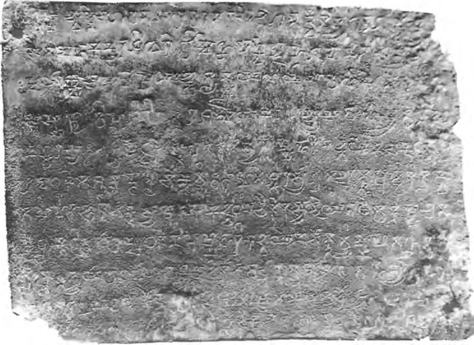
Plate 1: Gupta Copper Plate Inscription.