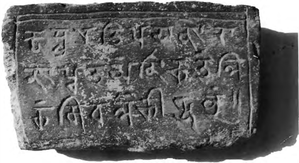
Plate 5: Śāradā Inscription.