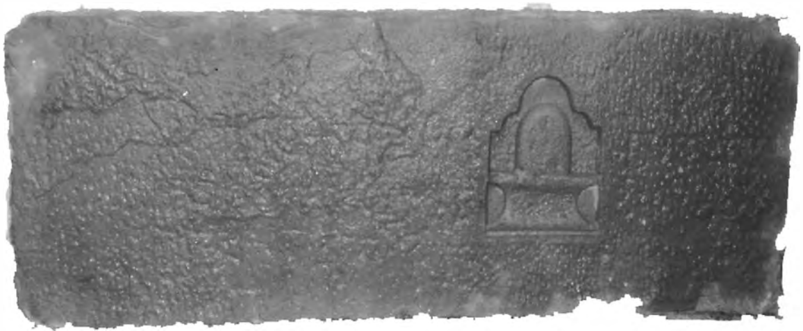
Plate 4: Linga Slab Inscription.