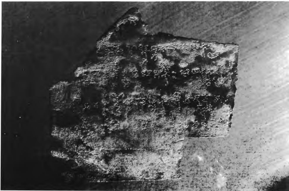
Plate 2: Second Copper Plate with Brāhmī Inscription.