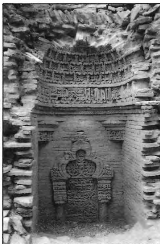
Pl. IV Khalid Tomb: Tilefoil arch in the Mihrab.