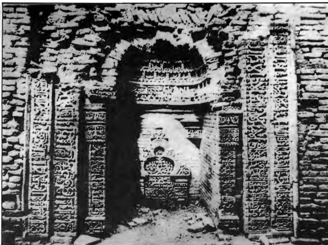
Pl. I Khalid Walid Tomb: the Mihrab