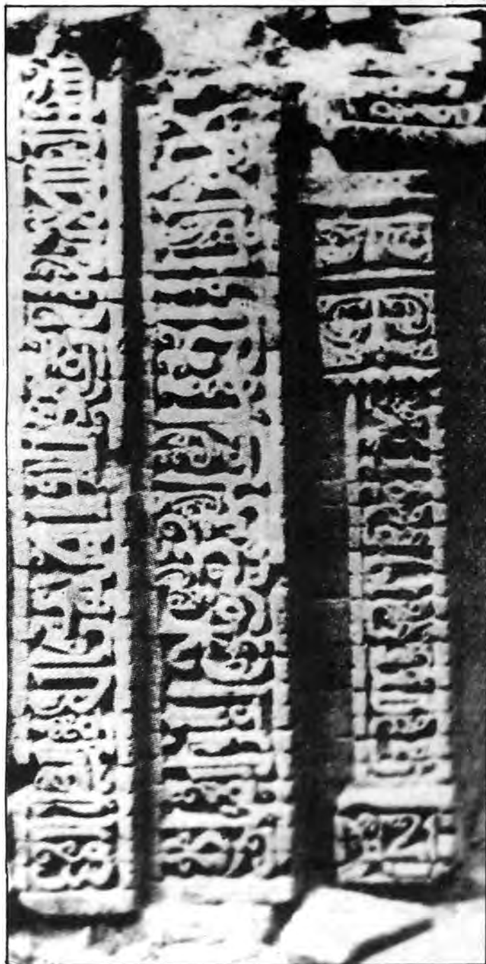
Pl. III Khalid Walid Tomb: left side of the Mihrab with Inscription.