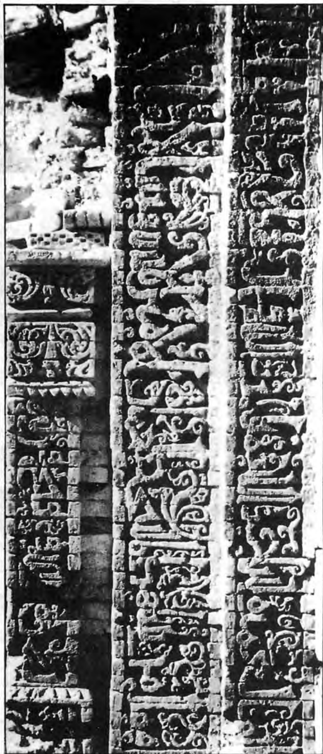
Pl. II Khalid Walid Tomb: right side of the Mihrab with Inscriptions.