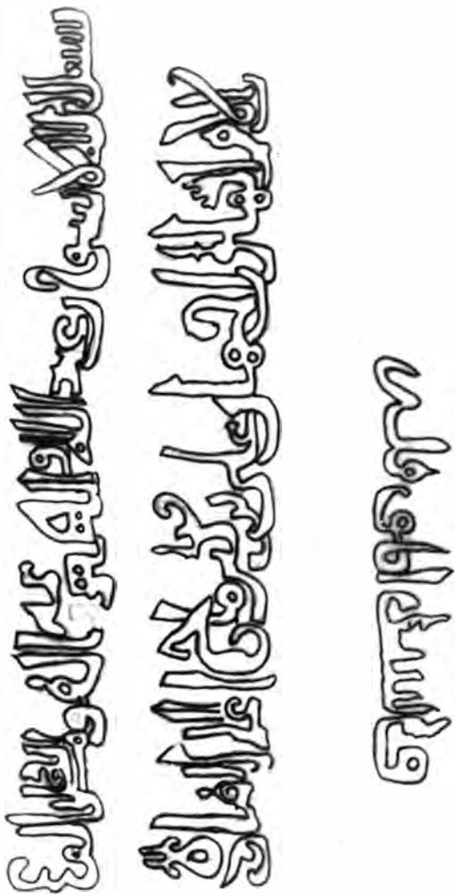
Fig. 3. Khalid Walid Tomb: Inscription on the left side (see Pl.-III).