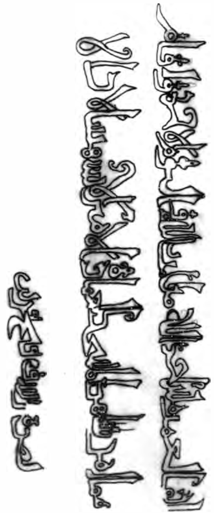
Fig. 2. Khalid Walid Tomb: Inscription on the right side (see Pl.-II).