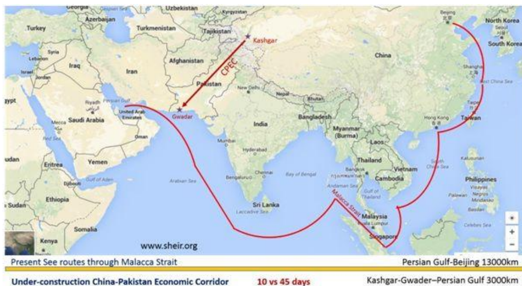
Figure 1: Comparison of CPEC route and the current route for trade used by China.

The overall cost and estimated financing are in two different parts. Different Chinese companies are investing directly $ 34 billion value of projects without any burden of debt on Pakistan. (Hussain I. , 2017). There are further $ 12 billion which will be concessional loan of mutual government with negotiable terms. It is utmost necessary to expose and disclose the negotiated term and conditions of these $ 12 billion to ensure the transparency of the said project. If all the facts and terms are disclosed then the speculations regarding being trapped into debt by these projects will itself banished. (Husain, 2017).